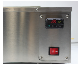
Micro Processor Control